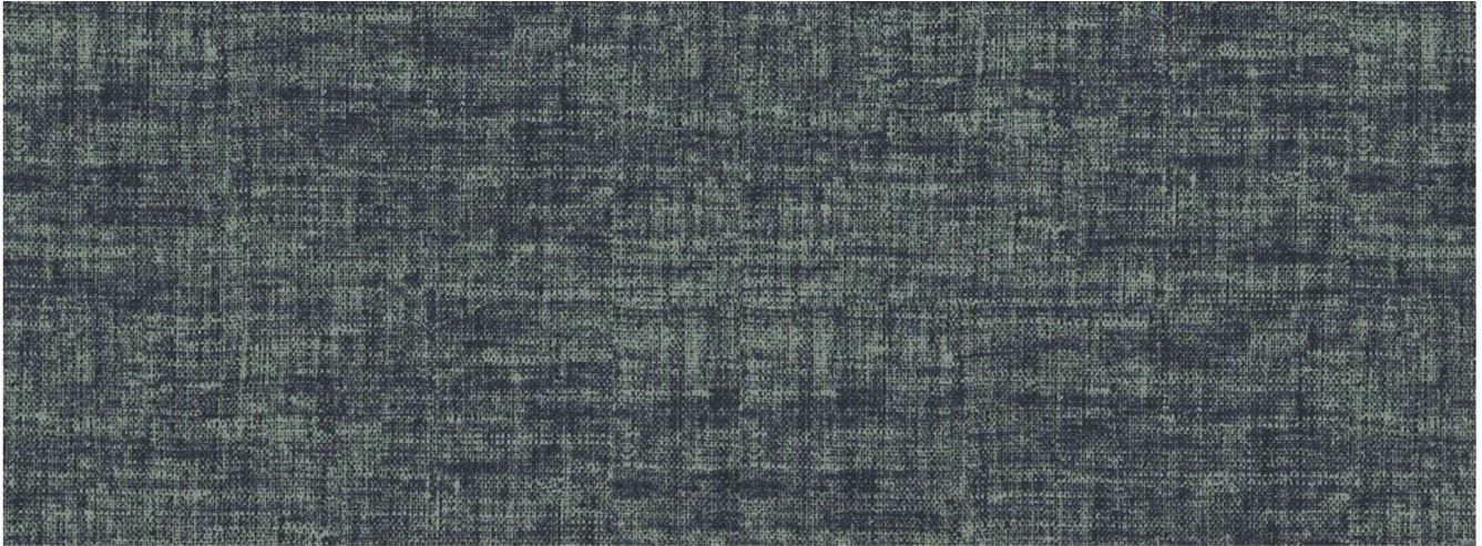
Represents 4.00m x 1.00m