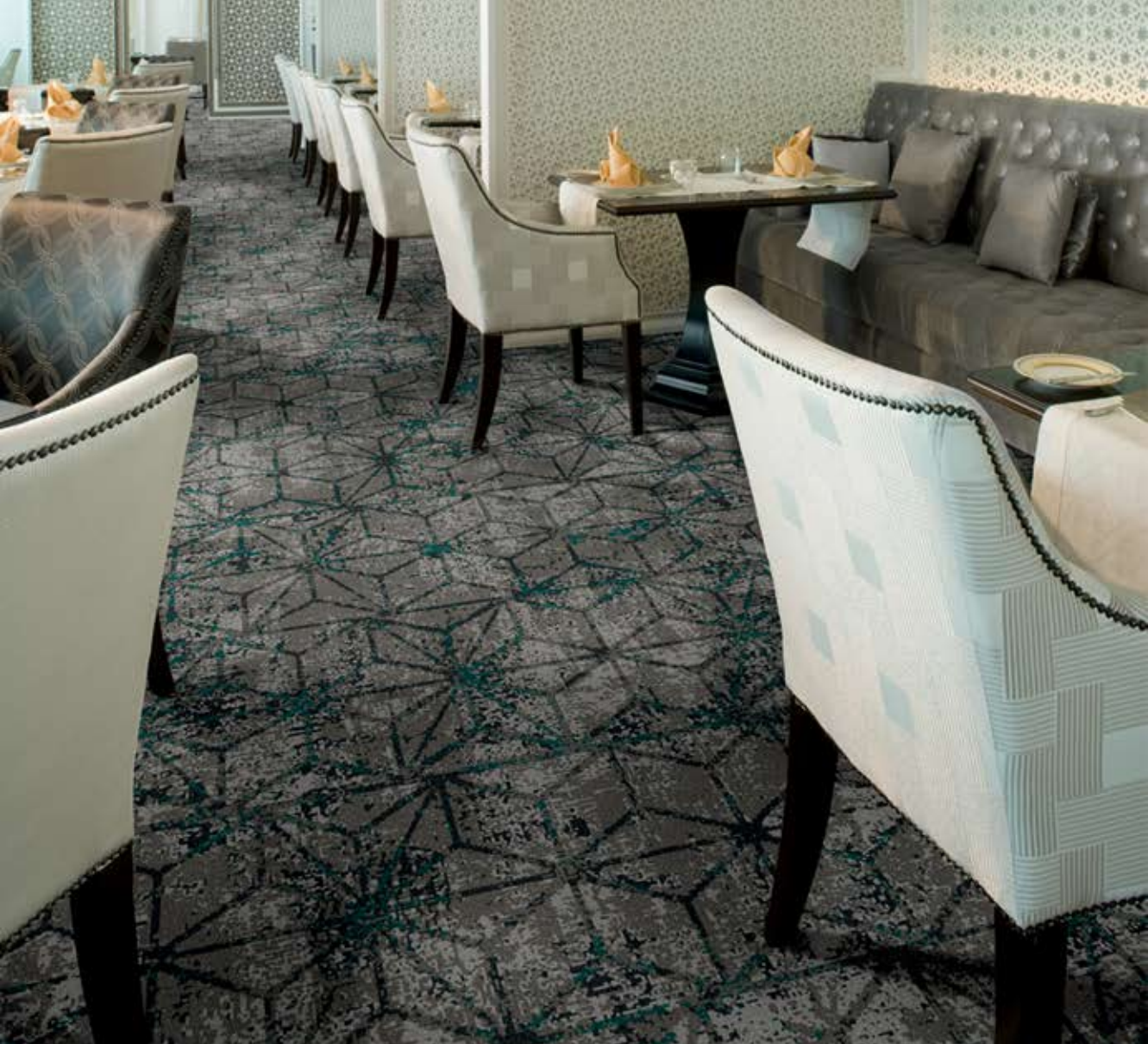
Represents 2mt x 1mt